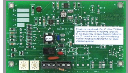
SP3219-1 Terminus One-zone Processor

For more information about our Terminus Processors and the complete line of Terminus perimeter intrusion detection systems contact us at 1.866.680.TERM (8376)