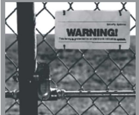
The SP3223 Pass-Thru Fence Kit contains an SP3237 Shock Sensor, a molded insert & a condulet housing.