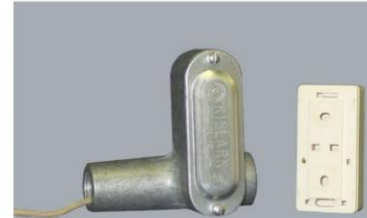
SP3224 Wall Kit

For more information about our Terminus Processors and the complete line of Terminus perimeter intrusion detection systems contact us at 1.866.680.TERM (8376).