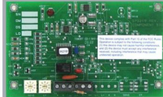
SP3219-1 Terminus One-zone Processor

For more information about our Terminus Processors and the complete line of Terminus perimeter intrusion detection systems contact us at 1.866.680.TERM (8376)