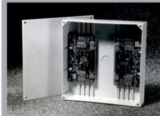
SP3219-4 Terminus Four-zone Processor